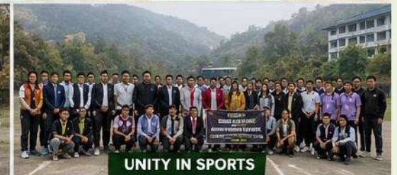
UNITY IN SPORTS