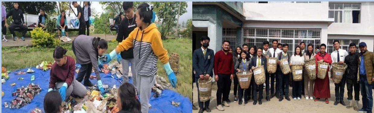
4. Waste Management Events