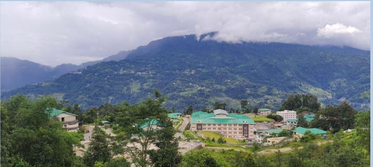
Bird's eye view of SMLGC, Aarigaon, Gyalshing