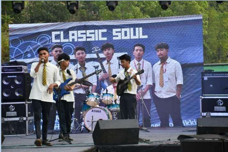
1. Participation in Music Festivals