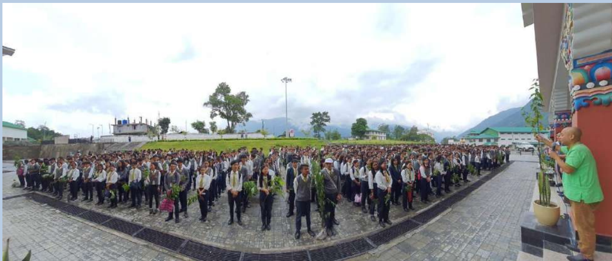
One students one sapling, World Environment Day

Sanchaman Limboo Government College, Aarigoan, Gyalshing