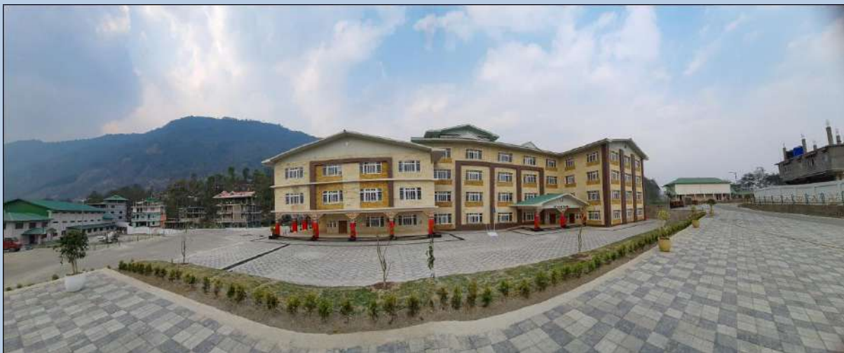
Academic Building – “Gyan Kunj” (Sanchaman Limboo Govt. College, Gyalshing )