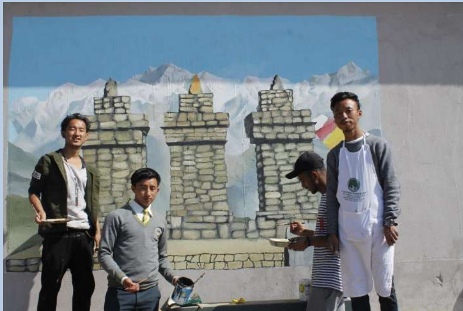
2. Creating Murals for campus buildings