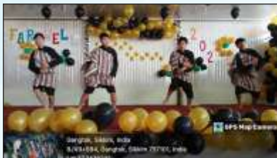
Gangtok, Sikkim, India 8,029-788, Gangtok, Sikkim 737101, India Lat: 27.343842°