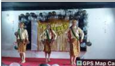
GPS Map Camera