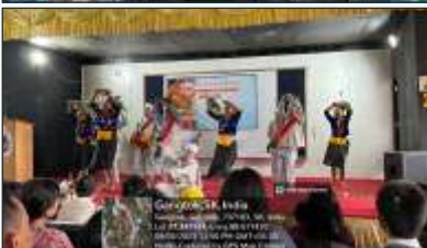
Gangtok, Sikkim, India 8,029-788, Gangtok, Sikkim 737101, India Lat: 27.343842° Long: 88.618237° GPS Map Camera