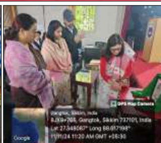
Gangtok, Sikkim, India 8,029-788, Gangtok, Sikkim 737101, India Lat: 27.343842° Long: 88.617994° 11/01/24 11:20 AM GMT +05:30