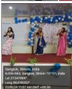
Gangtok, Sikkim, India 8,029-788, Gangtok, Sikkim 737101, India Lat: 27.343842° Long: 88.618237° 11/01/24 11:57 AM GMT +05:30